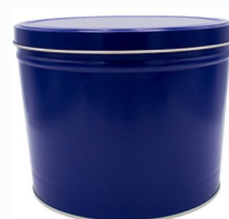
The Cookie Tin-16 Cookies 8 flavors, You Choose! $51.75 plus shipping