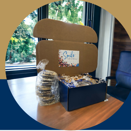
The Great 28

Packaging Options-Customizable All-In-One Box Belly Band Gift Box $3.00.