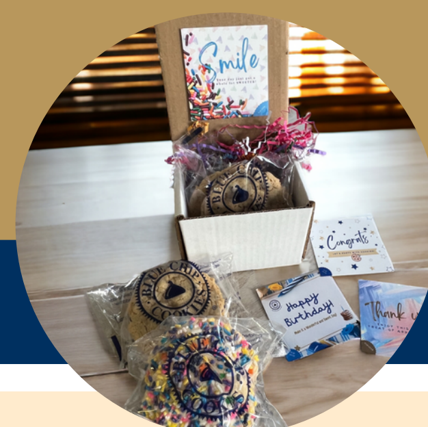
The Sensation Six