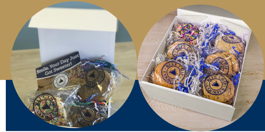
The Deluxe Trio

Packaging Options- Customizable All-In-One Box Belly Band Boxes +$5.00 Magnetic Keepsake Box +$8.00