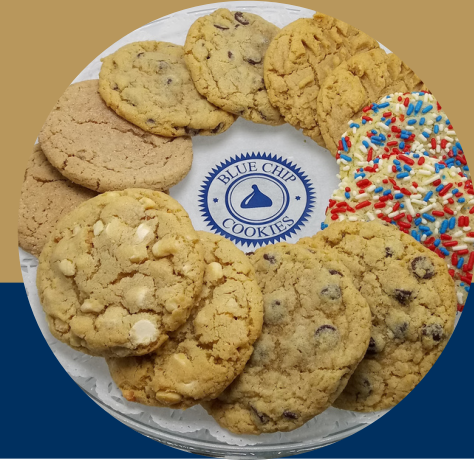
The Premium Portfolio

Packaging Options-Customizable All-In-One Box Belly Band Box +$3.00.