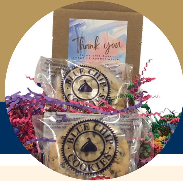
The Fab Four