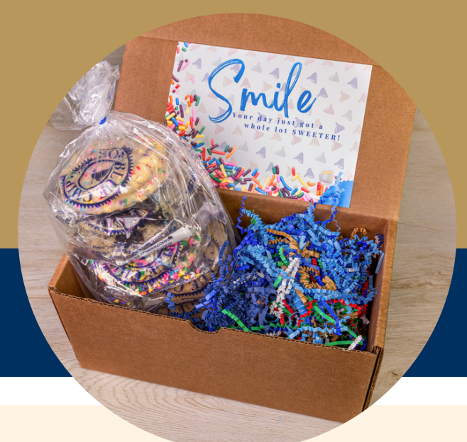
The Excellent Eight