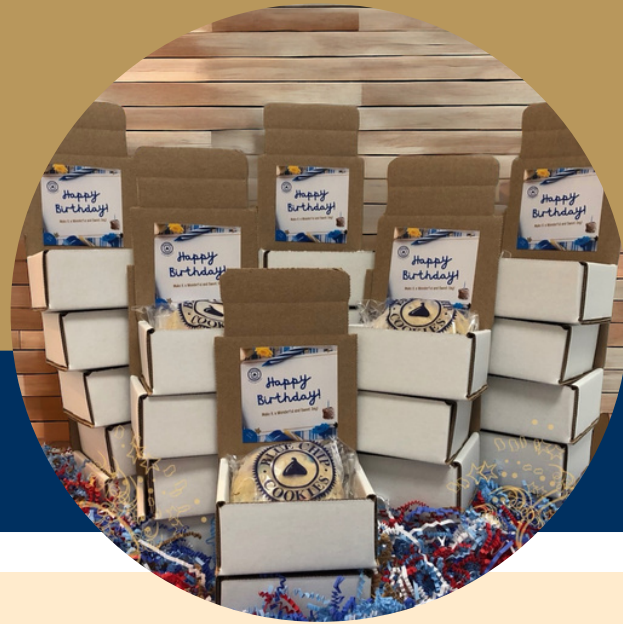
The Cookie Card