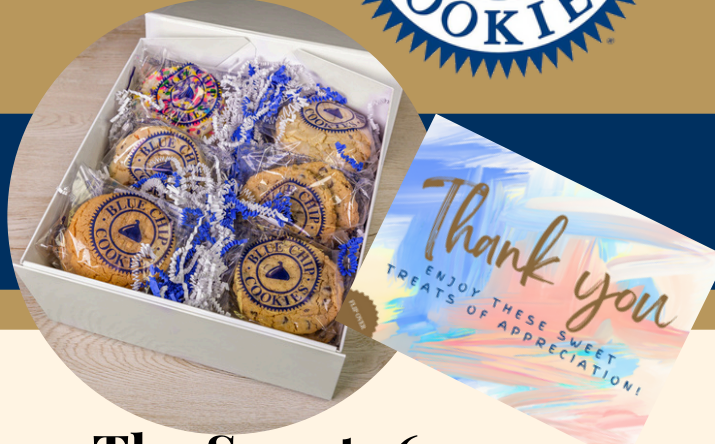
The Sweet 16