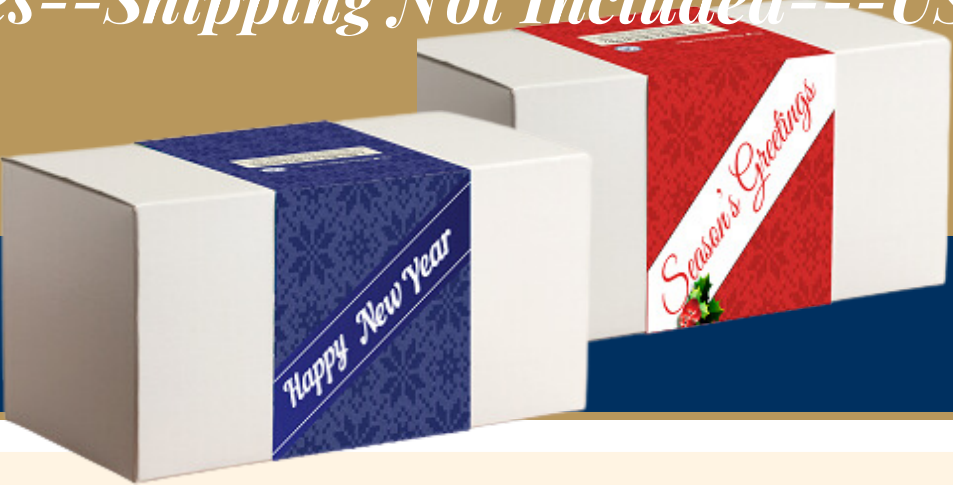
The Great 28--Also Known as "Tis the Season!"

USPS Priority or UPS Air add a 7th flavor for $4.00