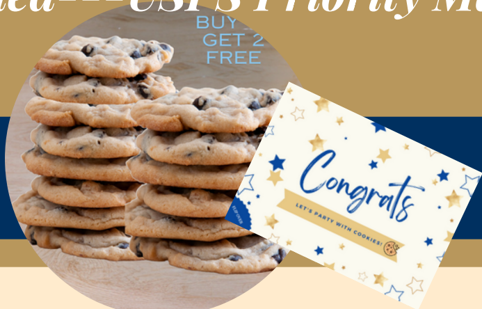
The Baker's Dozen Chocolate Chip