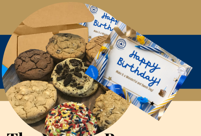
The Myway Box