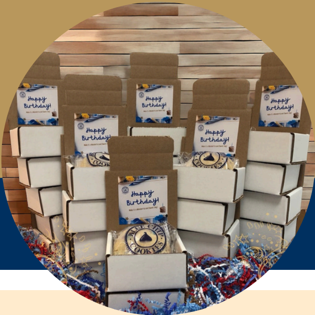
The Cookie Card

2 Cookies One Flavor $10.95 Shipping Included USPS Ground Advantage