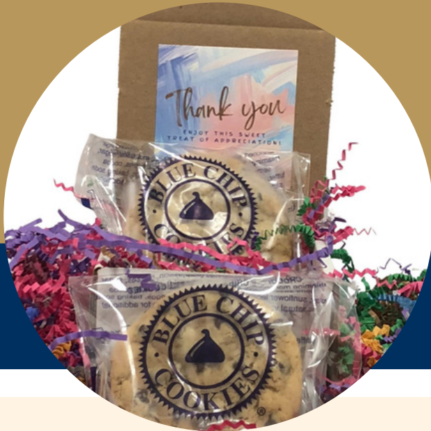
The Fab Four

4 Cookies Two Flavors $15.95 Shipping Included USPS Ground Advantage