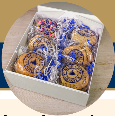
The Deluxe Trio