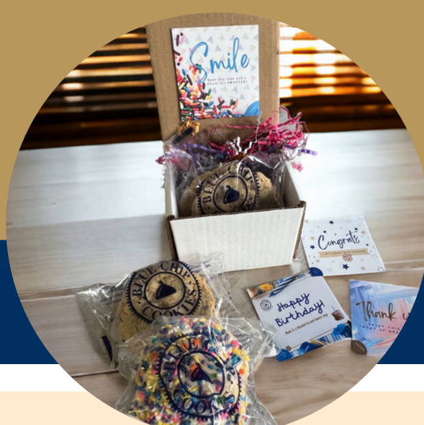
The Sensational Six

6 Cookies Three Flavors $23.95 Shipping Included USPS Priority Mail