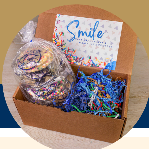
The Excellent Eight

8 Cookies Four Flavors $29.95 Shipping Included USPS Priority