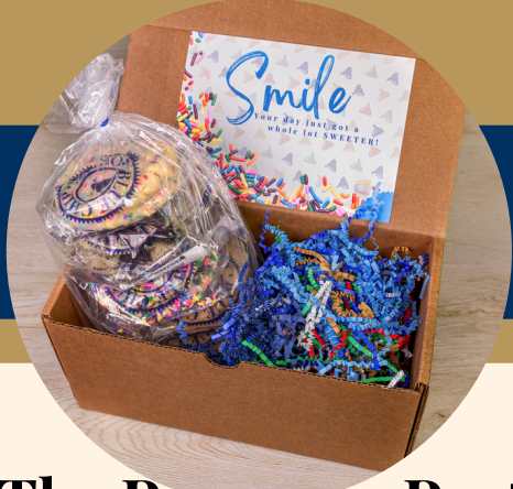
The Premium Portfolio