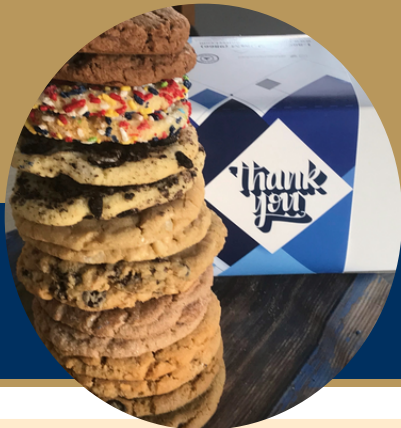
All Occasions Cookie Box