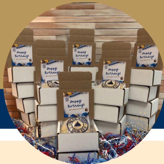
The Cookie Card