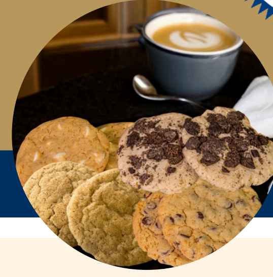
The Excellent Eight