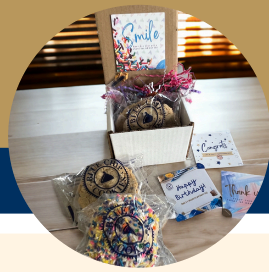
The Fab Four