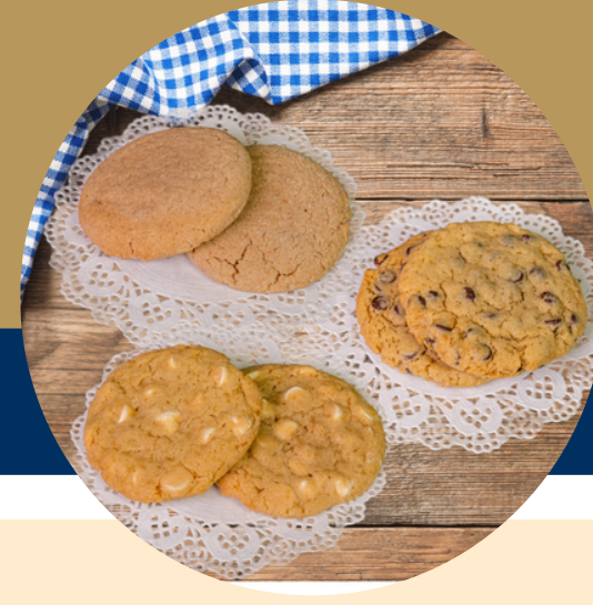
The Signature Six